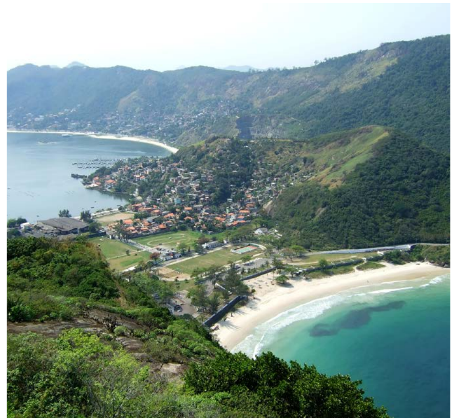
The large city of Rio de Janeiro is also known for its many beautiful beaches.

Sadly, some animals in the Amazon rainforest and the Pantanal could disappear from Earth forever. Every year, trees are cut down for timber and to clear land for farming. As a result, animals like the jaguar and the golden lion tamarin, a type of monkey, are losing their habitat. Many organizations are working together with the Brazilian government to keep this from happening.