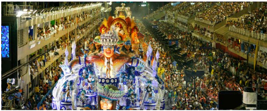
Rio de Janeiro has the largest Carnival celebration in Brazil. It is held in a special building called the Sambadrome .