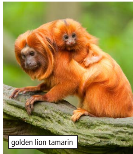
golden lion tamarin

Other parts of Brazil, such as the Pantanal wetlands, also include unique animals. Storks and herons build nests in the Pantanal's trees. Colorful parrots, such as the blue and yellow macaw, fly overhead. Deer and jaguar roam the land. Giant anteaters also live in the Pantanal.