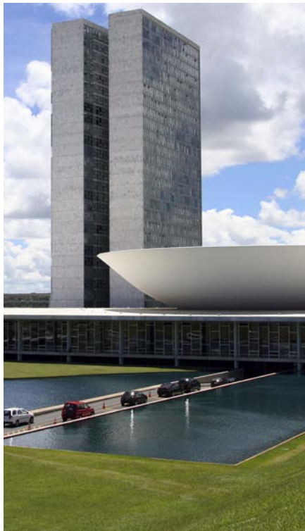
Brasília is filled with many modern buildings.

Although it is still new, Brasília is growing quickly. More than two million people live and work there. Many people work for the government, since the city is Brazil's political center.