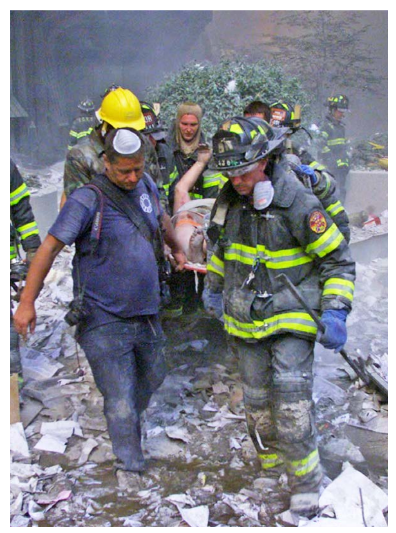
An injured man gets help from firefighters.

Firefighters looked for people to rescue. They found lost people and took hurt ones to doctors.