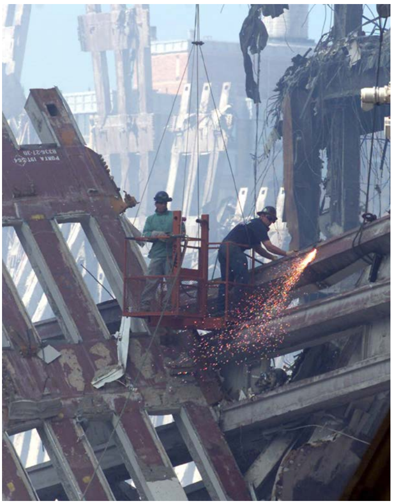
Ironworkers cut beams from the ruins of the burned towers.

Ironworkers came from all over to help. Ironworkers are builders. Some of them had built the buildings that burned.