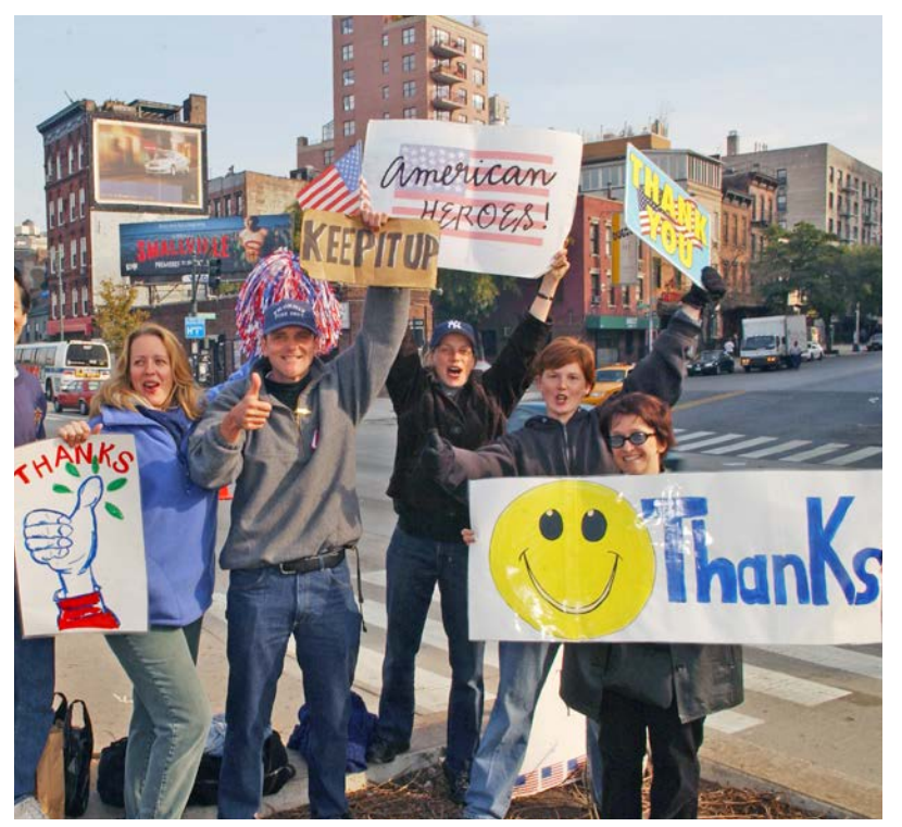
People offer thanks to the heroes of September 11.