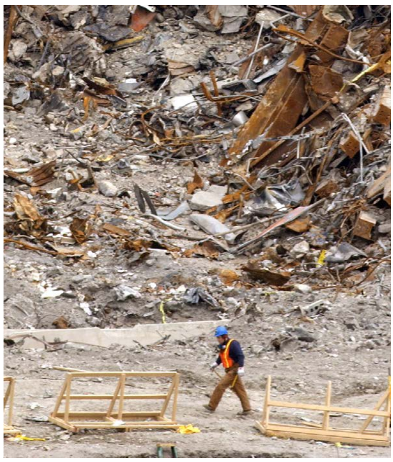
A worker walks past the ruins of the Twin Towers.

Firefighters looked for people to rescue. They found lost people and took hurt ones to doctors.