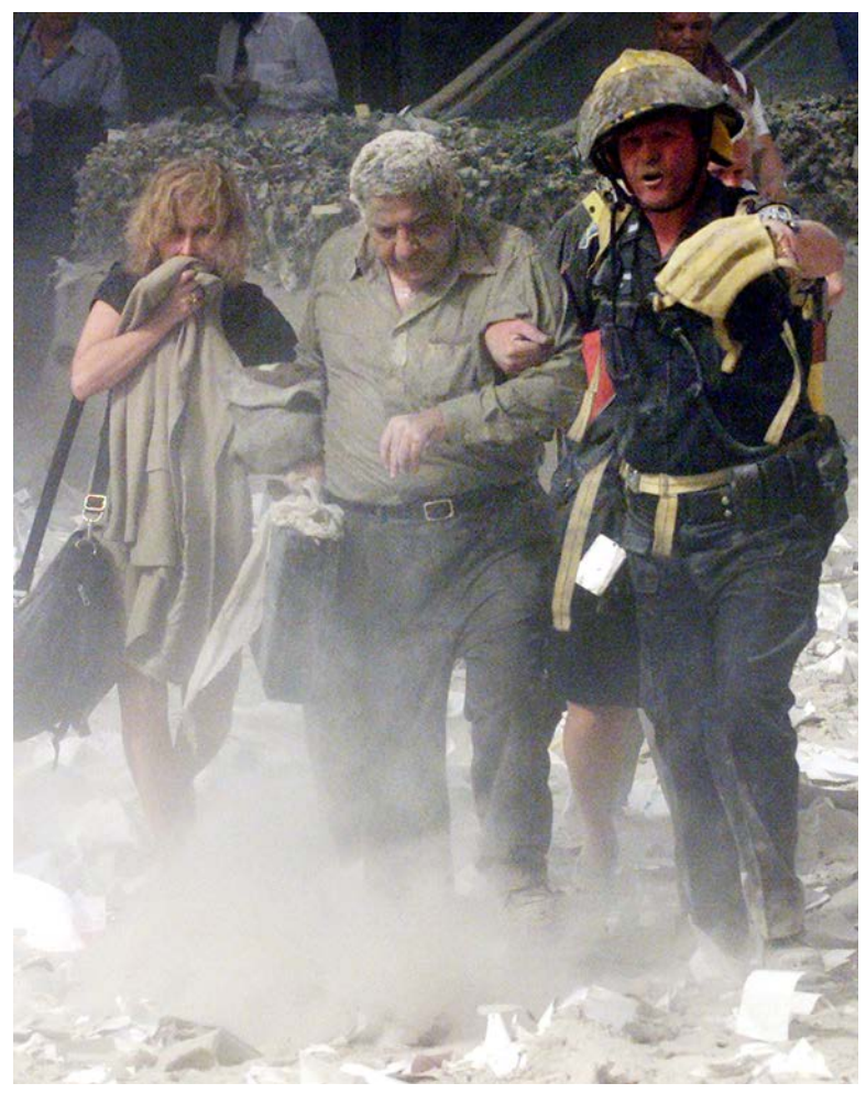
People are helped away from one of the Twin Towers.