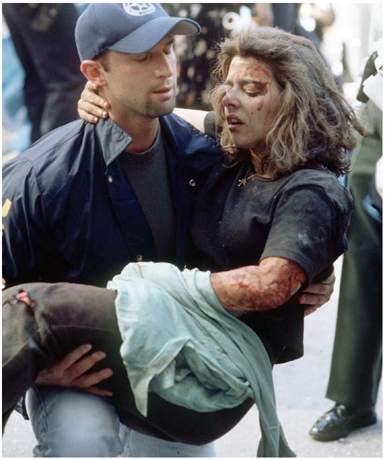
A man carries a woman injured in the Twin Towers.

The burning buildings filled with smoke. It wasn't safe to use the elevators . People rushed down the stairs.