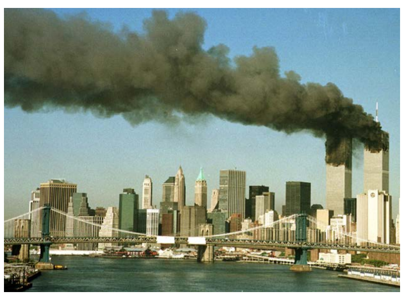
Smoke floats across the East River after the Twin Towers in New York City catch fire.