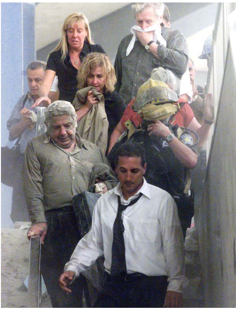
People walk out of one of the burning towers.