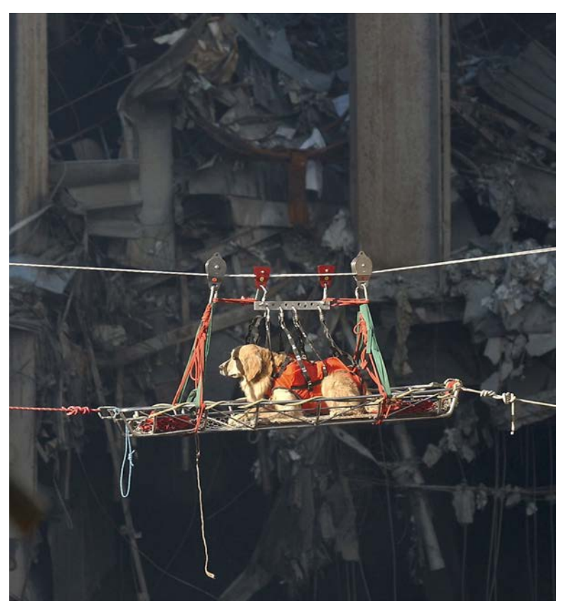
A rescue dog is moved out of the ruins.