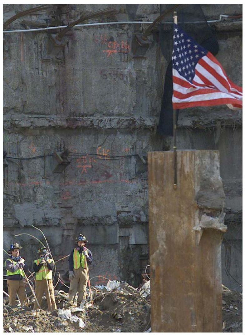
Firefighters stand in the ruins where the Twin Towers once stood.

Firefighters raced to the burning buildings and ran inside. They put themselves in danger to save others.