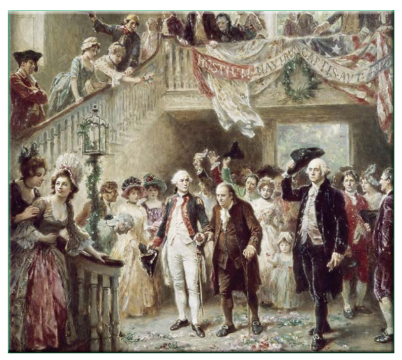
A painting depicts the Constitutional Convention in Philadelphia, where the U.S. Constitution was drafted. It features Ben Franklin (in brown) and George Washington (in black), two of the thirty-nine actual signers.