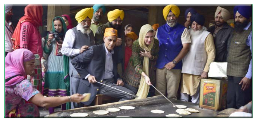
The U.S. ambassador to India (seated, center) and his wife perform service at a community kitchen during their visit to India's Golden Temple in 2016.